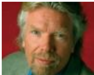
Sir Richard Branson

SOHO attracts amazing presenters including entrepreneurs, industry and business experts providing excellent value to conference delegates, sponsors and exhibitors.