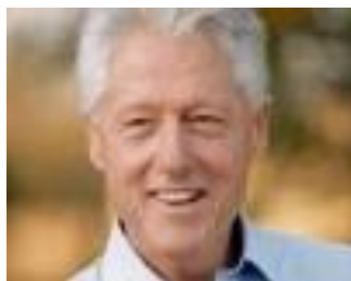
President Bill Clinton