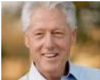
President Bill Clinton