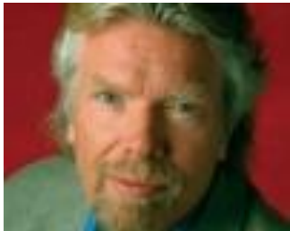
Sir Richard Branson

SOHO attracts amazing presenters including entrepreneurs, industry and business experts providing excellent value to conference delegates, sponsors and exhibitors.